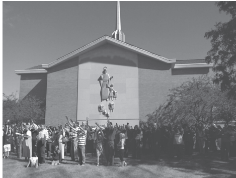
Rally Day congregation under the Good Shepherd